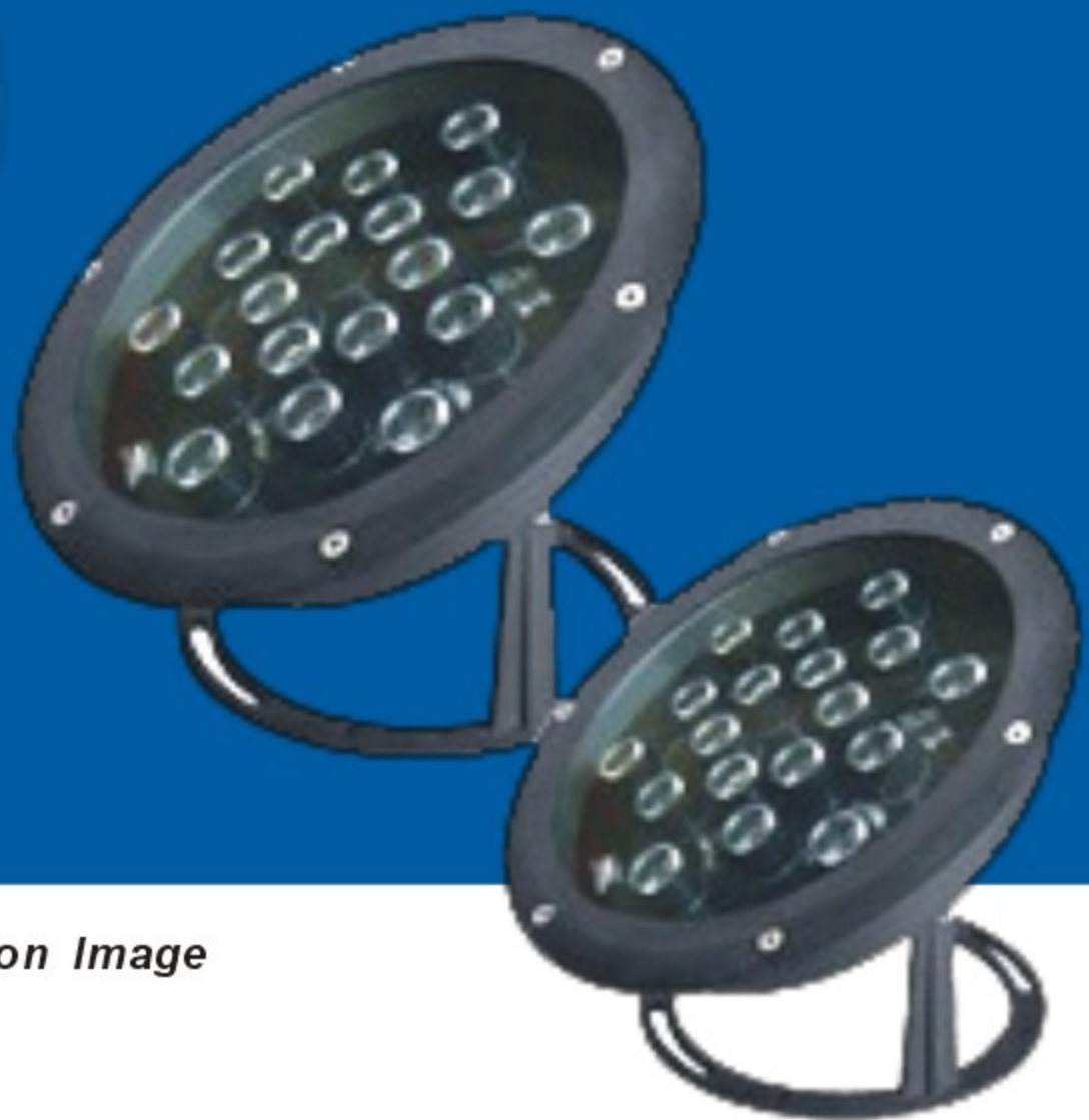
• Dimension Image